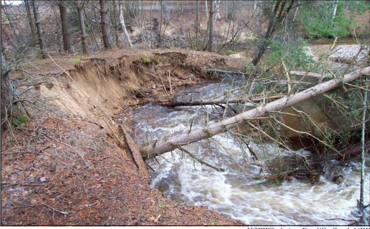
- USFWS photos, Pendills Creek NFH

Pendills' Creek and Videans' Creek. When the Pendills' Creek spillway washed out, water flow to the hatchery was reduced. The spillway repair project involved cooperation among many different agencies including the Michigan Department of Environmental Quality, U.S. Forest Service and various U.S. Fish and Wildlife