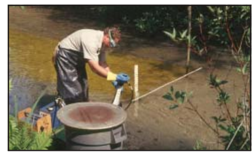
Biologists from the Ludington and Marquette Biological Stations in Michigan applied lampricide to 28 Great Lakes tributaries. The chemical used, TFM, destroys larval sea lamprey present in the streambed.

contract with the Great Lakes Fishery Commission. The successful control program continues to ensure sport fish rehabilitation in the Great Lakes and protects a fishery valued at over $4 billion.