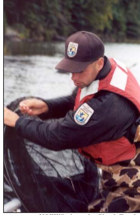
While on Isle Royale, fykes nets are placed at several locations to capture fish for assessment.

fingerlings. This allowed the brook trout to be stocked after a five and a half hour boat trip. The fingerlings were stocked off the bow of the Ranger III, a first for this stocking event. Things went smoothly, and after stocking at the two points, the Ranger III