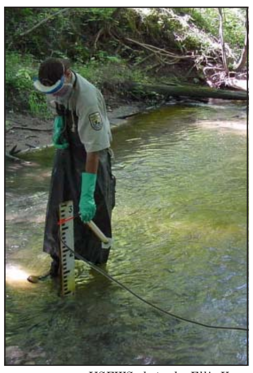
- USFWS\ photos\ by\ Ellie\ Koon