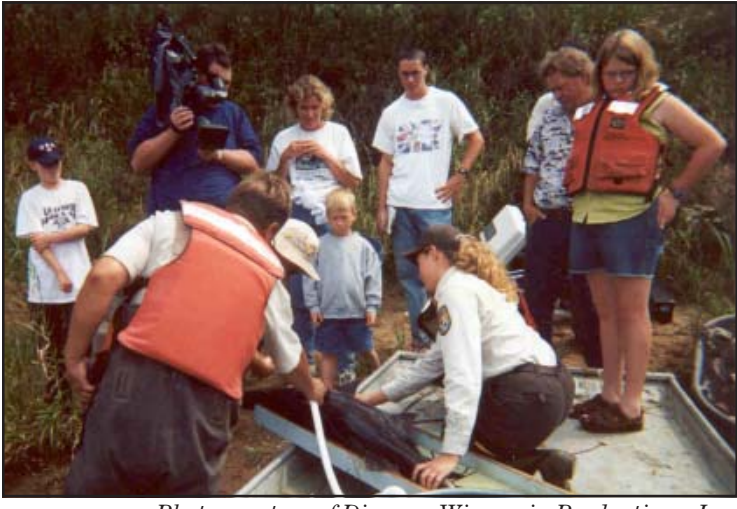
LaCrosse FRO biologists demonstrate tagging procedures on a paddlefish as students watch and "Into the Outdoors" television records the event.

their 'Into the Outdoors' adventure with paddlefish ... an educational adventure that many other children in the Midwest will also be able to enjoy early next year.