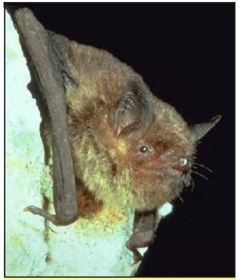
The gray bat is a federally endangered species.

In 2001, the Service provided funding to coordinate a project that