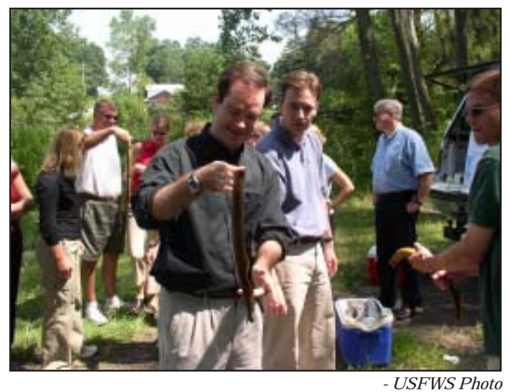
A Congressional staff member gets up close and personal with an adult sea lamprey.

With the Welland Canal in Niagara Falls, Ontario as a backdrop and with a display depicting all facets of sea lamprey control in the Great Lakes, FWS staff explained the devastation caused by one invasive species, the sea lamprey, in the Great Lakes and what has been accomplished to date to control the pest. Following this initial orientation and later in the tour, Congressional staff were provided an opportunity to view assessment and control techniques streamside on Delaware Creek (Erie County, New York). There staffers viewed a