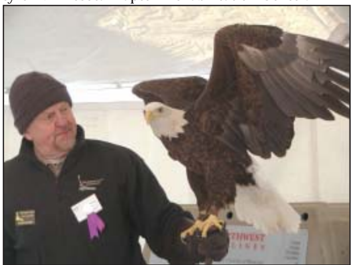
A bald eagle from the University of Minnesota' Raptor Center was present for the festivities.

Visitors were able to warm up at the bonfire, where marshmallow roasting and a sing-a-long took place, and inside the oneroom school house where face painting, nature crafts and the Friends of Sherburne gift shop were