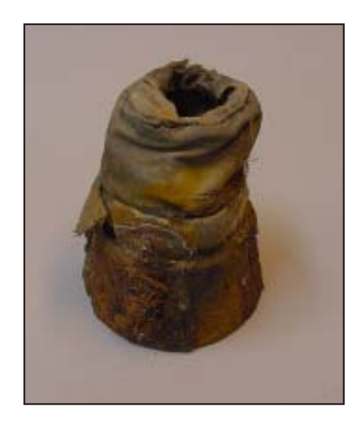
The howitzer sabot with attached powder bad is on display as part of the Bretrand Collection at DeSoto NWR.

rare mountain howitzer sabot with attached powder sack in the Steamboat Bertrand Collection was treated by J. Claire Dean, Conservator, Dean & Associates Conservation Services, Portland, Oregon, using monies allocated by Art & Artifact funding. Dean traveled to DeSoto NWR in early February 2004 to treat the object since it was deemed too fragile to be shipped to Oregon for conservation. In addition to reviewing previous conservation work performed on the artifact, Dean fabricated an internal mount to better support and display the attached powder sack. Sabots are the wooden "cup" holders which were strapped to cannonballs or canister shot; a powder sack containing black powder was attached to the sabot to provide the charge to expel the munition from a canon. The Bertrand's sabot with powder sack is one of only a