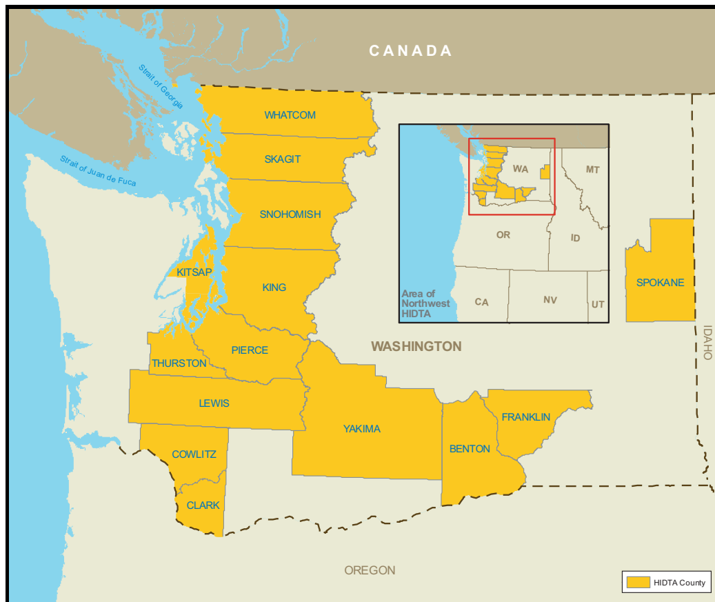
Figure 1. Northwest High Intensity Drug Trafficking Area.

recent law enforcement reporting, information obtained through interviews with law enforcement and public health officials, and available statistical data. The report is designed to provide policymakers, resource planners, and law enforcement officials with a focused discussion of key drug issues and developments facing the Northwest HIDTA.