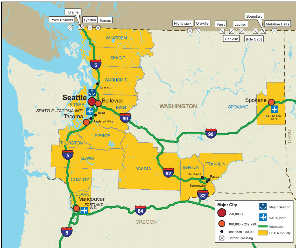
Figure 2. Northwest HIDTA transportation infrastructure.