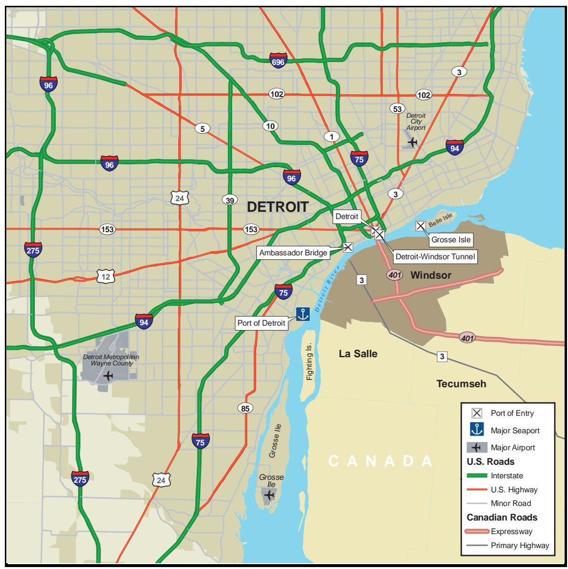
Figure 2. International border between Detroit, Michigan, and Windsor, Ontario.

throughout Michigan and several other states, including Georgia, Kentucky, Ohio, Pennsylvania, and West Virginia.