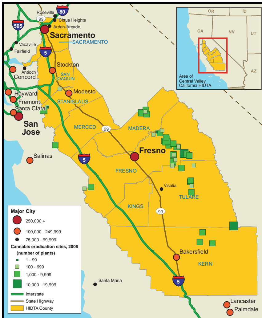
Figure 2. Central Valley California HIDTA cannabis eradication sites, 2006.