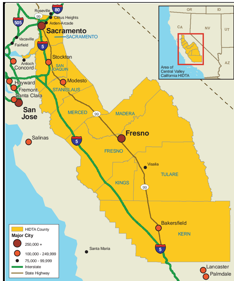
Figure 1. Central Valley High Intensity Drug Trafficking Area.

reporting, information obtained through interviews with law enforcement and public health officials, and available statistical data. The report is designed to provide policymakers, resource planners, and law enforcement officials with a focused discussion of key drug issues and developments facing the Central Valley California HIDTA.