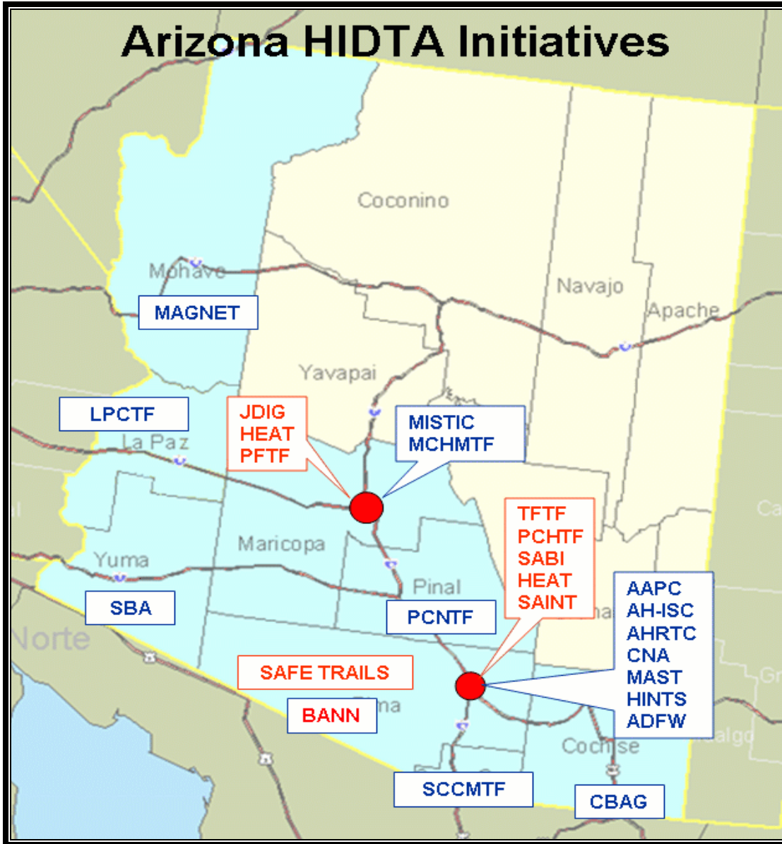
MAP 1: Arizona Region HIDTA Initiatives

This report documents the Arizona Region HIDTA's enforcement activities and successes in achieving the outcomes and HIDTA goals for CY 2005. The HIDTA Program provides additional federal resources to eliminate or reduce drug trafficking and its harmful consequences. Law enforcement organizations within HIDTAs assess drug trafficking problems and design specific initiatives to reduce or eliminate the production, manufacture, transportation, distribution and chronic use of illegal drugs, and money laundering.