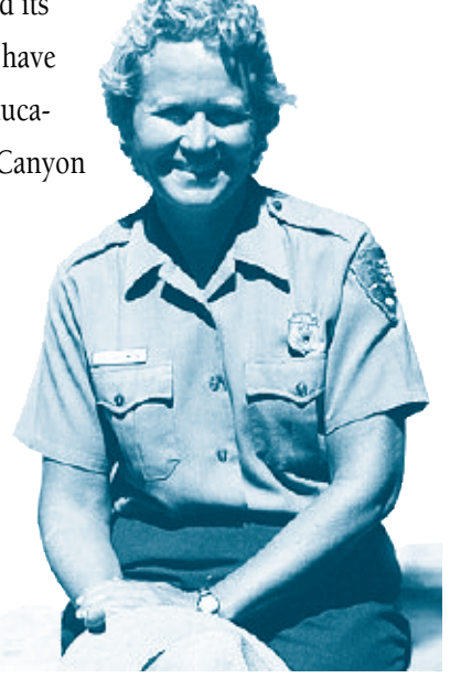
Chief of Interpretation, Grand Canyon National Park