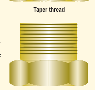
Straight (parallel) thread

The openings on aluminum alloy DOT specification oxygen cylinders must be configured with straight threads only.