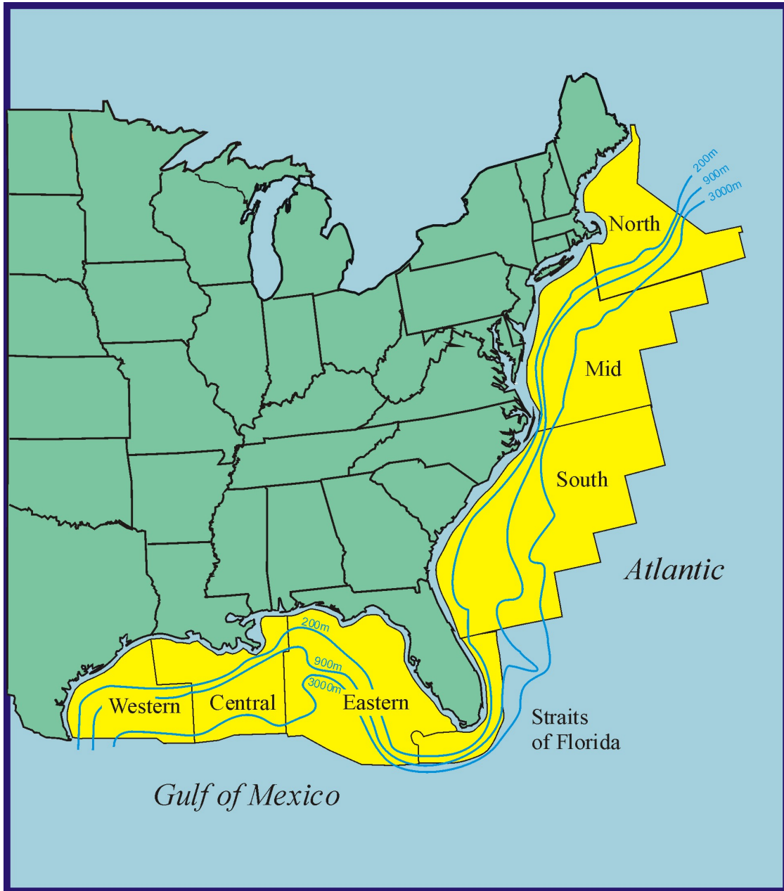
Figure 1. Map of the Planning Area