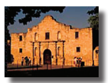
The Alamo in San Antonio