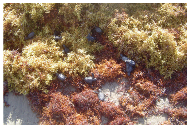
Kemp's ridley hatchlings crawling over Sargassum

One last consideration if you enjoy our vast beach is that the algae help the beach grow. After washing ashore, sargassum lays exposed in the hot Texas sun. As it dries, it turns black and becomes extremely light weight. The strong winds that forced it ashore now push it to the base of the sand dunes where it is buried by blowing sediments. Rotting occurs beneath the hot sand that frees up organics that newly emerging plants utilize for nutrients. Those plants in turn collect and hold sand thereby allowing the beach to expand and stabilize itself.