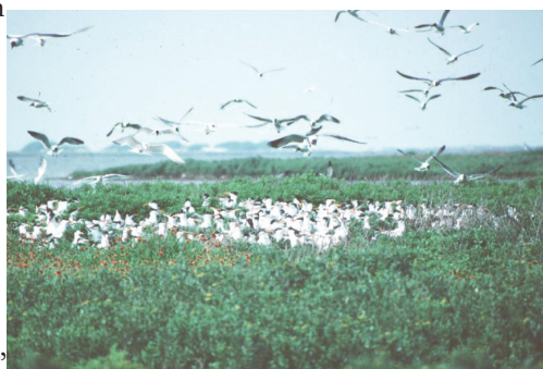
Nesting Terns on the Laguna Madre

Spring also brings welcoming and farewell parties for several raptor species. The long-time winter resident, the Peregrine Falcon, makes its way back to the north and west to begin nesting on cliffsides. Following it are the American Kestrel, which visits South Texas only in the fall and winter, and the Merlin that returns to the upper reaches of North America for its breeding season. Although the Peregrine Falcon, American Kestrel, and Merlin find south