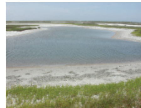
Pond at Yarborough Pass

Primitive - there are no facilities. A camping permit is required and is available from the Malaquite Beach Visitor Center. Reservations are not needed. Located on the Laguna Madre 15.5 miles south of the visitor center. No fee is charged for use. Access to the area is possible only through the four-wheel drive area of South Beach. To find the campground (not a developed campground) drive to the 15- mile marker then backtrack approximately 100 yards and look for a notch in the dunes. Driving through the pass and following the road approximately 1-2 miles to the campground. Be aware that the notch through the dunes is sometimes filled with exceptionally deep and soft sand in which even four-wheel-drive vehicles become stuck occasionally. Do not drive on the mudflats surrounding the campground. Fines for damaging the mudflats are heavy.