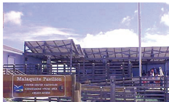
Malaquite Visitor Center

Semi-primitive, providing only toilets, rinse showers, picnic tables, and 48 designated sites (6 sites are for tent camping only, 26 are for tent or RV camping, and 16 are for RV's only). An $8 fee is required; $4 with a Golden Age or Golden Access passport. There are no hook-ups.