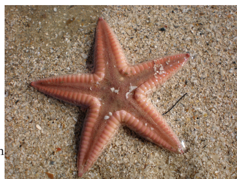
Armored Seastar

One echinoderm, commonly called starfish or sea stars, possess a well-developed sense of smell, touch, and taste. Sea stars respond to the presence of light. Normally, they like to eat their prey whole. To digest larger prey, they extrude their stomachs outside of their bodies. If snacking on a tasty clam or other bivalve, sea stars will use their suction cup tube feet to pry open the shell and slip their stomach in between the two shells. They will then digest the soft parts of the animal by slathering digestive enzymes secreted by their stomach all over their lunch.