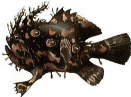
Sargassum Angler Fish Histrio histrio

If you wish to see how animals utilize it, join a ranger on a beach walk. Using a small mesh net provided by the ranger, visitors wade out into the surf and dip up the sargassum. The algae is taken ashore and shaken vigorously over a container of sea water. What often falls out is a cornucopia of tiny crabs, shrimps, fishes, and other strange creatures like the Sargassum Angler Fish ( Histrio histrio ). To migrating shorebirds this represents a feast to gorge on before journeying northward. For birds nesting here, the creatures washing ashore with the algae will provide a dependable source of food for themselves and their hungry chicks well into mid summer when diminishing winds finally cease pushing Sargassum onto the beach. Even tiny Kemp’s ridley sea turtle hatchlings born here swim out to sea to hide and feed within the algae mats until they grow large enough to safely venture away from their refuge. The thick mats of algae also provide a sanctuary for any of several dozen fish species as they too seek to escape hungry predators. Consider, too, that those big tuna and mackerel that we eat didn’t start out big. They also hid around and among the Sargassum as they grew from being prey themselves into full grown predators.