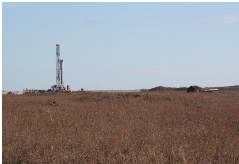
Wilson Well as seen from the Novillo Camp Line

Exploration, development, and production of oil and gas minerals have occurred on Padre Island since the early 1950s. Ninety-one operations have been conducted to date, including 60 abandoned and plugged wells, 9 seismic operations, 5 pipelines, 8 active gas wells, 1 water well, and 1 active drilling operation. Most of these operations took place between 1951 and 1981, with at least 14 operations pre-dating the establishment of Padre Island NS in 1962. The park is presently reviewing four plans of operation for permitting six new wells over approximately the next 12-18 months.