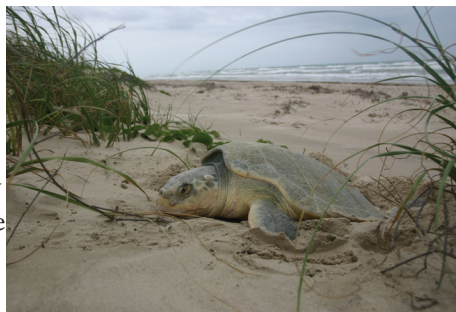
Kemp's ridley nesting

YOU CAN HELP RESTORE THE WORLD'S most endangered sea turtle species by watching for these two-foot-long, olive green turtles nesting on the beach and reporting them. Kemp's ridley turtles come ashore during daylight hours between April and mid-July to lay their eggs, only taking 45 minutes to crawl up the beach, bury the eggs in the sand, and return to the sea.