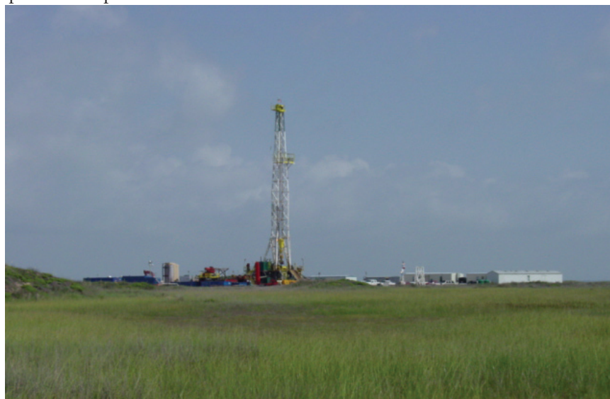
Wilson well just east of the entrance station

MANY VISITORS TO PADRE ISLAND NATIONAL SEASHORE WONDER WHY they are seeing evidence of oil and gas development in a National Park Service unit. In fact, Padre Island NS is one of 13 NPS units whose enabling legislation specifically allows oil and gas exploration and development activities to occur within their boundaries. The federal government owns the land of Padre Island NS, but the mineral rights are privately owned, and the NPS is mandated to allow development of nonfederal oil and gas rights held by individuals, companies, nonprofit organizations, and state and local governments that pre-date the park units.