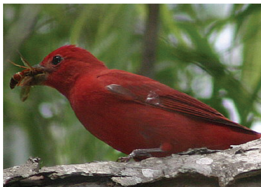
A Summer Tanager with a wasp, an example of a Neotropical migrant.

Because of its geographic location and great bird habitat and food resources, Padre Island National Seashore is a prime setting to witness spring bird migration. The park provides breeding and nesting, wintering, and stopover habitat to all types of neotropical migrants, raptors and owls, shorebirds and terns, waterfowl, and colonial nesting waterbirds.