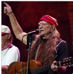
Selling Farm Aid