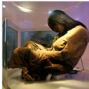
Museum Unveils a Long-Frozen Maiden