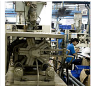
Why Lead in Toy Paint? It's Cheaper