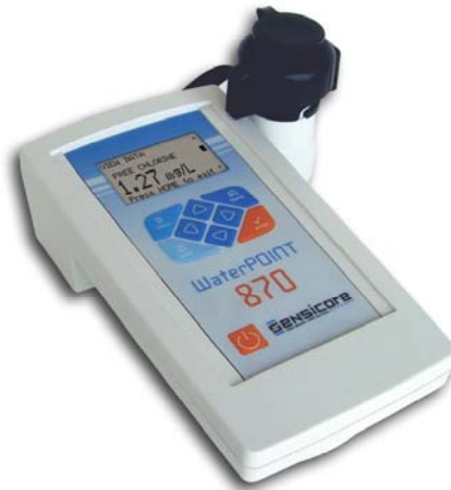
Figure 2-1 Schematic of a WP870 sensor (left) and a photo of the handheld unit (right)

liquids) in five minutes. This handheld system was designed for both municipal and industrial applications. It employs Sensicore's platform sensor chip with five membrane-based ion selective electrodes capable of detecting light metal ions and dissolved gases, two micro amperometric arrays for detecting free chlorine and monochloramine species, and electronic sensors for measuring oxidation-reduction potential (ORP), conductivity, and temperature. All of these sensors are incorporated on a single silicon substrate that is 4 millimeters (mm) × 5 mm in size and conveniently packaged in a semi-disposable unit that also contains its own reference electrode. In all, with the direct measurements and calculated values that can be obtained from the direct measurements, the system reports 16 different results as follows: pH, ORP, conductivity, total dissolved solids, free chlorine, monochloramine, free and total ammonia, chlorine-ammonia ratio, biocide-food ratio, carbon dioxide, total alkalinity, calcium, calcium hardness, total hardness, and Langelier Saturation Index. Only the direct measurements including pH, ORP, conductivity, free chlorine, monochloramine, free ammonia, calcium hardness, and total alkalinity results were verified during this test.