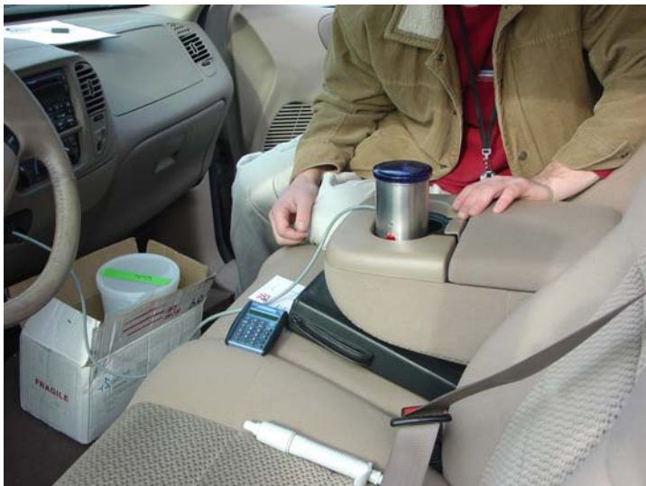
Figure 6-2. PharmaLeads' Portable Incubator Operates Using a Car Auxiliary Power Outlet and Fits into a Cup Holder