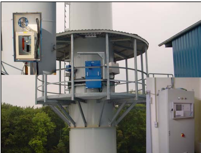
Figure 2-1. Photograph of AMESA

The titanium probe is used for both the isokinetic sampling and cooling of the hot flue gas to less than 50°C. The cooled flue gas, together with any accumulated condensate, is fed into the cartridge filled with adsorption resin (XAD-2) via an upstream quartz wool filter.