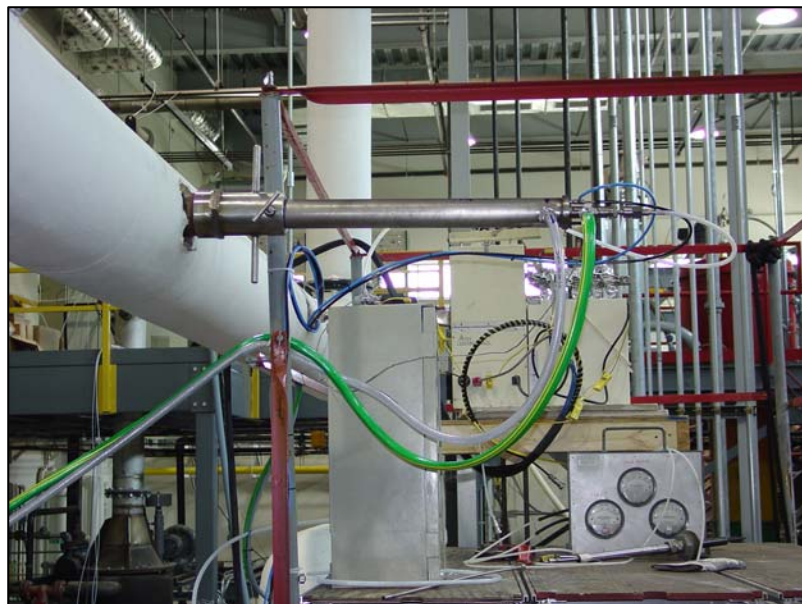
Figure 3-3. Installation of AMESA Sampling Probe

Figure 3-3 shows the installation of the AMESA sampling unit on the duct. Since the diameter of the exhaust duct was considerably smaller than normal full-scale applications, the installation of the AMESA probe was modified from the normal configuration. The modified installation required a section of unheated Teflon tubing (approximately 1 meter in length) to deliver the sample gas from the exit of the probe to the sampling media. Because of the potential for loss of