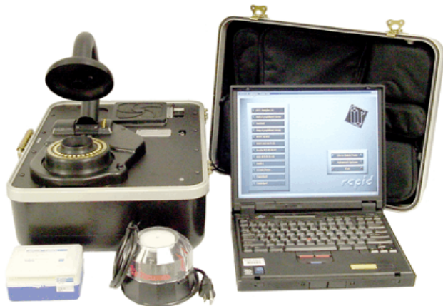
Figure 2-1. Idaho Technology Inc.'s R.A.P.I.D. ® 7200 Instrument

optimized and validated for the R.A.P.I.D. ® 7200 instrument and contains all the ingredients necessary for DNA purification [one 30 milliliter (mL), one 20 mL, and one 25 mL buffer; 50 bead tubes with lysis buffer; 50 spin filters; 200 receiver tubes; and 50 swabs].