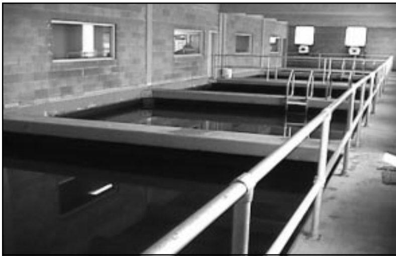
Many water treatment plants filter their water.

While filtration was a fairly effective treatment method for reducing turbidity, it was disinfectants like chlorine that played the largest role in reducing the number of waterborne disease outbreaks in the early 1900s. In 1908, chlorine was used for the first time as a primary disinfectant of drinking water in Jersey City, New Jersey. The use of other disinfectants such as ozone also began in Europe around this time, but were not employed in the U.S. until several decades later.