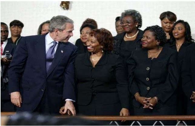
President George W. Bush visits with parishioners at Union Bethel African Methodist Episcopal Church in New Orleans, LA.

On January 15, 2004, President Bush visited Union Bethel A.M.E. Church in New Orleans, where he met with Americans whose lives have been changed due to the efforts of faith-based and community organizations. The President also spent time with the dedicated people who run the programs that help those in need. President Bush spoke of the need to break down bureaucratic barriers to faith-based and community groups and encouraged partnerships between the government and the most effective social service organizations that are helping the most vulnerable Americans.