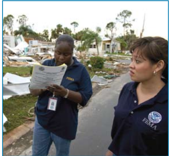
FEMA Community Relations employees assist residents at a grass-roots level by going neighborhood by neighborhood in hard hit disaster areas ensuring everyone who needs help is getting it.

FEMA, through its National Preparedness Directorate and U.S. Fire Administration, provides prevention and preparedness programs, research, data collection and national policy guidance. FEMA trains emergency managers, firefighters, elected officials and other emergency responders through a variety of courses in all-hazards emergency