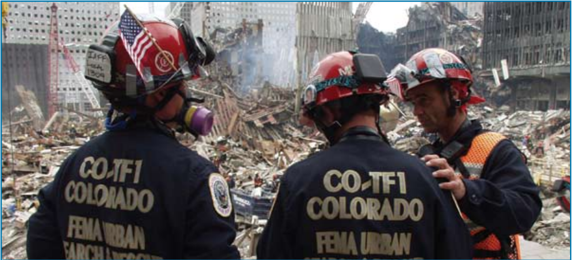
Members of the FEMA Urban Search and Rescue, Colorado Task Force 1, receive instructions before entering Ground Zero at the World Trade Center.