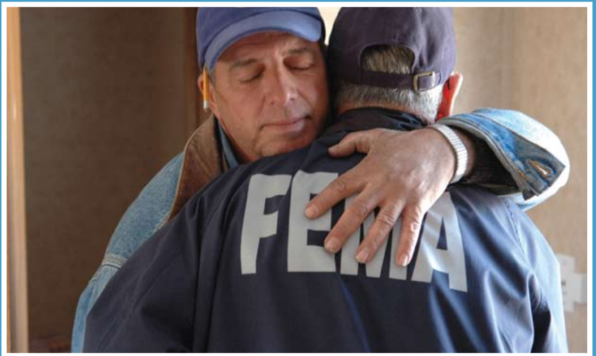
Disaster victim hugs FEMA employee after receiving direct Housing Assistance for temporary housing.

FEMA'S MISSION is to reduce the loss of life and property and protect communities nationwide from all hazards, including natural disasters, acts of terrorism, and other man-made disasters. FEMA leads and supports the nation in a risk-based, comprehensive emergency management system of preparedness, protection, response, recovery and mitigation.