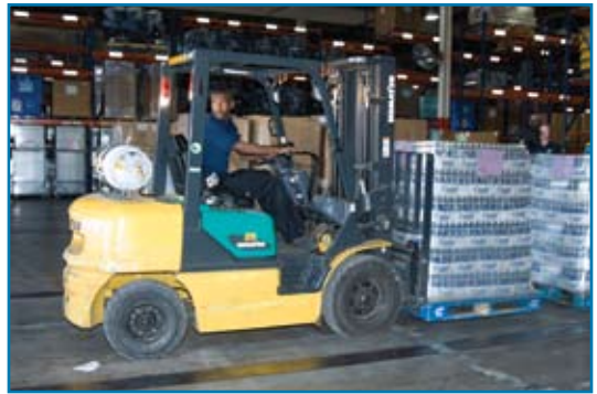
Supplies being loaded at one of eight FEMA logistics centers, which support FEMA disaster responders with critical equipment and supplies and also provide resources to states during disaster operations.

• Continuity Programs – FEMA supports upgrades to and implementation of the Integrated Public Alert and Warning System. It is the lead agent for the Nation's programs in ensuring the continuity of government operations and essential functions and the endurance of our constitutional form of government in a catastrophic event.