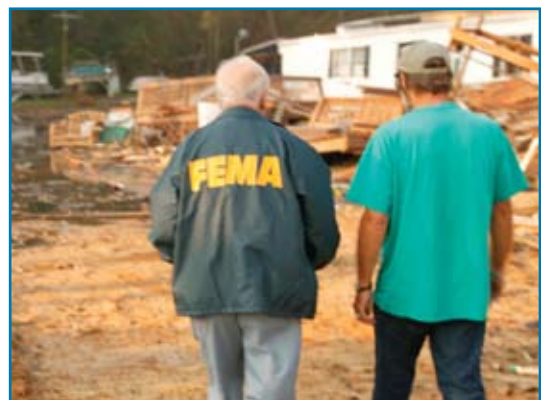
A FEMA Community Relations employee talks with a victim, providing pamphlets and brochures with vital information about FEMA programs and steps to take to apply for assistance.