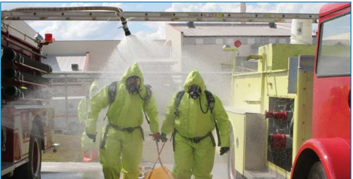
Emergency responders in Level B Personal Protective Equipment conduct decontamination training at FEMA's Center for Domestic Preparedness. The center's performance-based instruction features the only toxic chemical agent training for civilian responders.

planning and response. In addition, FEMA works through its National Emergency Training Center and Center for Domestic Preparedness, as well as with other training partners, to establish and deliver effective training and professional education programs and develop a national certification system for overall emergency management competency and expertise.