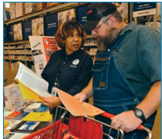
FEMA Mitigation staff gives flood repair and prevention information to a shopper at a local home building store.