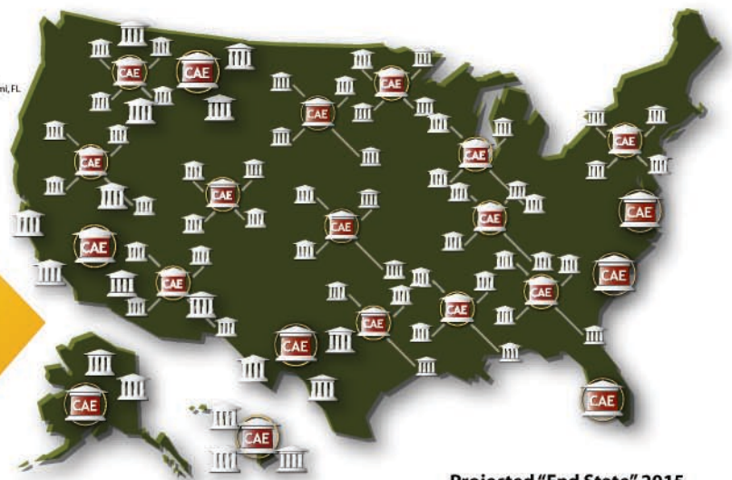
Projected "End State" 2015