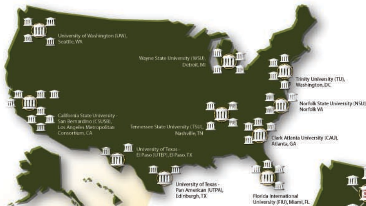
IC CAE Status