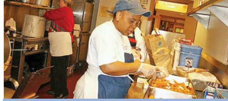
Angelina's Center for Homeless Women

In addition, county staff worked with private, for-profit developers on covenant agreements in master planned developments in Redmond that will lead to the production of over 200 units of rental housing affordable to households with incomes from 80% to 120% of area median income, and 126 units of ownership housing affordable to households from 100% to 120% of area median income.