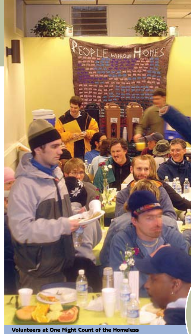
Volunteers at One Night Count of the Homeless

The Salvation Army received funding to construct a new 7,500 square foot food bank with 16 parking spaces on a vacant parcel of land in Renton. The project included landscaping for an edible garden that is open for picking to food bank customers as fruits and vegetables become available, and herbs from the garden are used in the cooking classes.