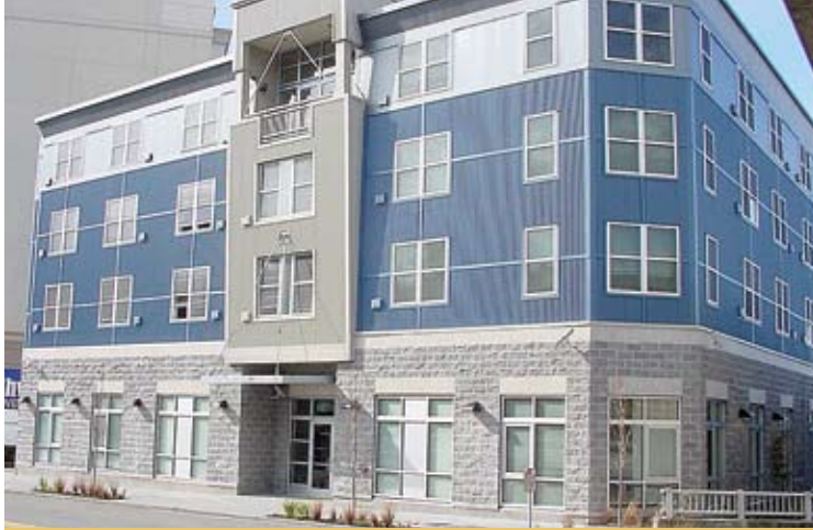
Eastlake Supportive Housing

Owned by the Downtown Emergency Service Center, the 1811 Eastlake Supportive Housing Project opened its doors in December of 2005. The first of its kind in Seattle, this project offers a unique array of permanent housing services and amenities to its target population of homeless chronic alcoholics.