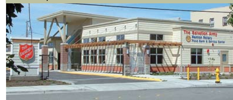
Salvation Army Food Bank in Renton