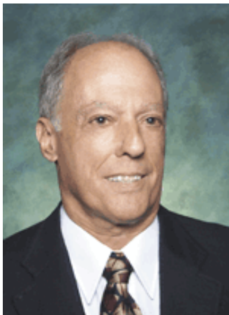
Recipient of the "2002 NCHS Director's Award for Equal Employment Opportunity and Civil Rights Program Activities"