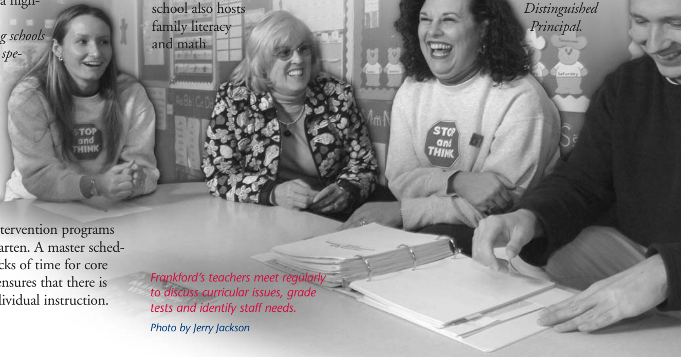
Frankford's teachers meet regularly to discuss curricular issues, grade tests and identify staff needs.