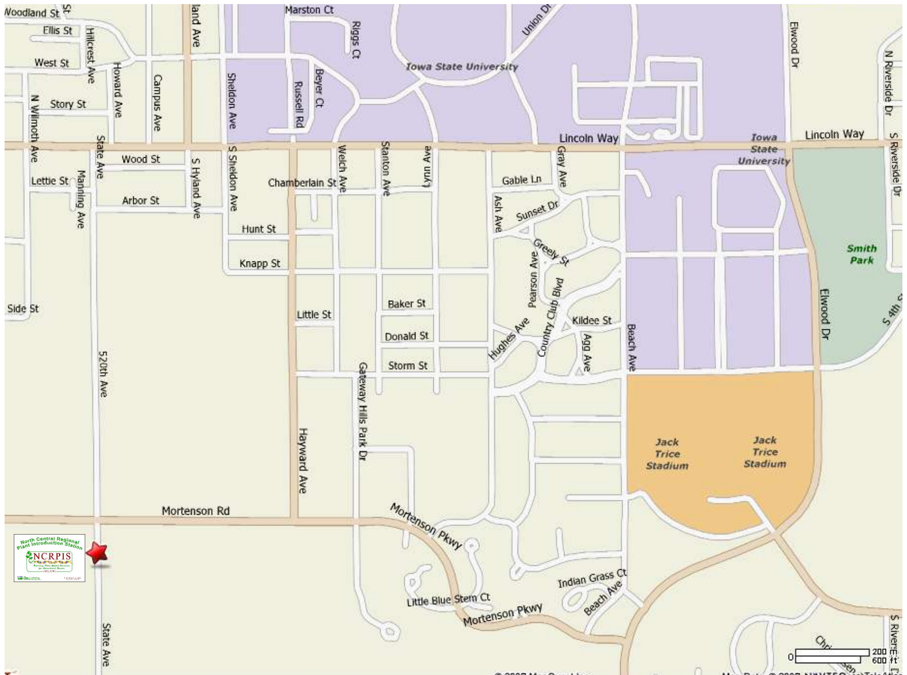
Map from mapquest.com