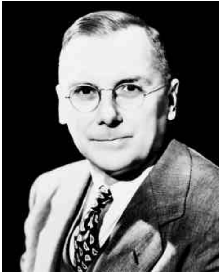
Dr. Hugh L. Dryden - portrait in 1958.

He died of cancer Dec. 2, 1965, just four and one-half years before Neil Armstrong, a former Flight Research Center research pilot, became the first person to step onto the moon's surface.