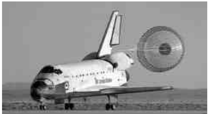
The space shuttle Atlantis lands with its drag chute deployed on Runway 22 at Edwards, Calif., to complete the STS-66 mission.

Rosamond Dry Lake at Edwards Air Force Base also has two lakebed runways available for special landings, if needed.