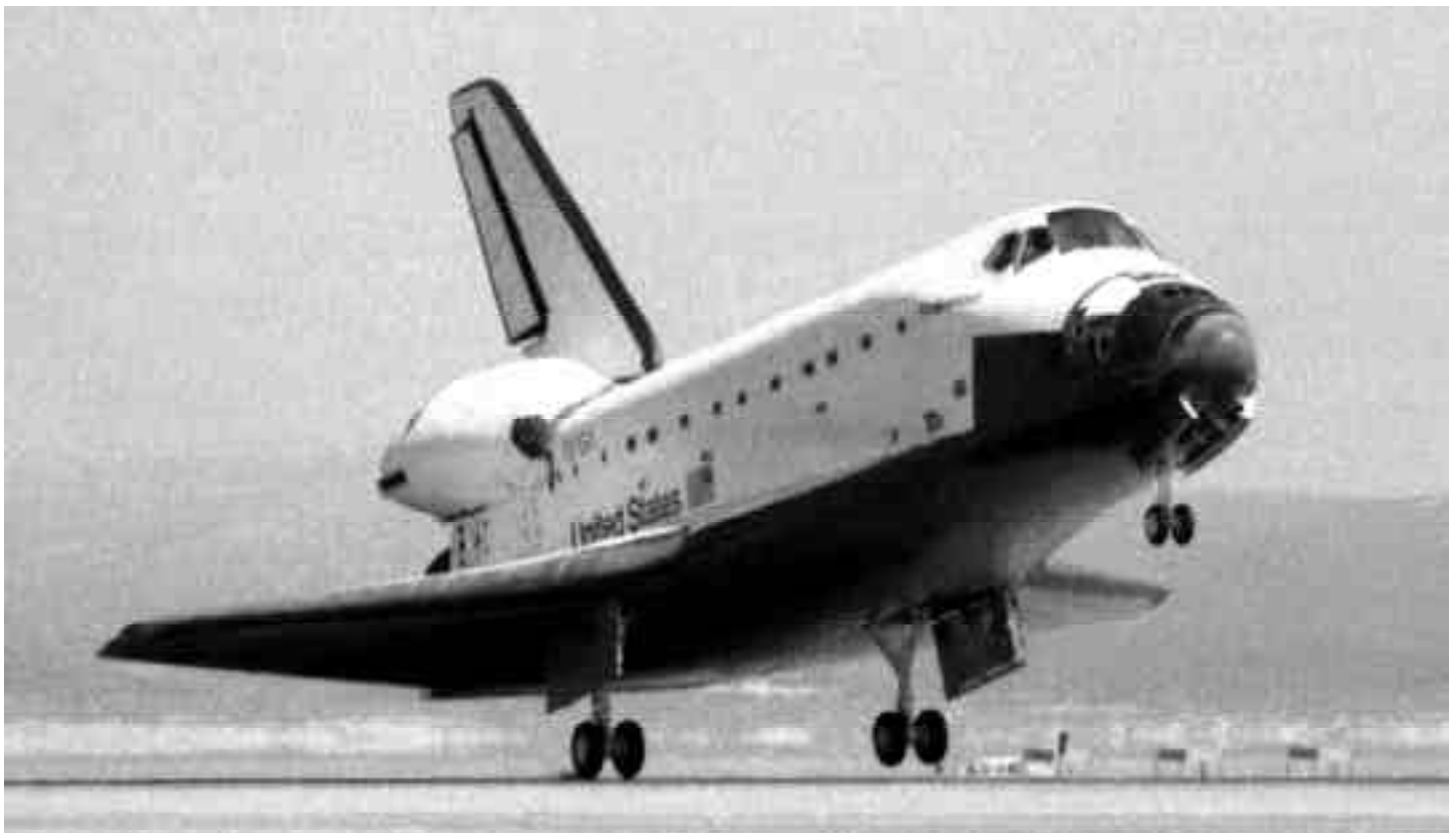
STS-67 Endeavour landing at Edwards.

Among the most prominent aerospace projects associated with the NASA Dryden Flight Research Center, Edwards, Calif., is the Space Transportation System (STS) — the space shuttles developed and operated by NASA.