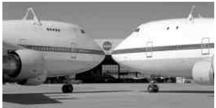
The two shuttle carrier aircraft, nose-to-nose.

The SCA is now the standard ferry vehicle.