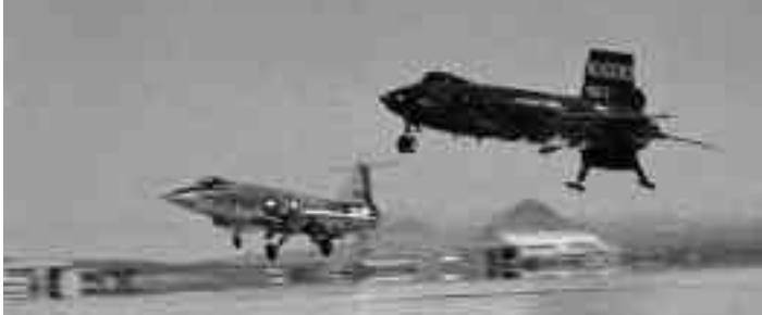
X-15 #3 and F-104A chase plane landing.

Using three research vehicles (one was lost in an accident late in the program), 12 pilots assigned to the program at the Flight Research Center collected a wealth of data between 1959 and 1968 on 199 research flights. Much of this information fanned out across the aerospace industry and has been applied to commercial and military aircraft and to the nation's space programs.