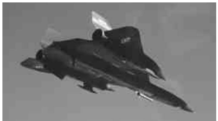
YF-12A in flight with "cold wall" experiment.

In 1972, Dryden began research flights with the first aircraft equipped with an all-electric, digital flight control system. This was the F-8 Digital Fly-By-Wire, which used electrical impulses instead of mechanical means to link cockpit controls and actuators moving the rudder, elevators, and ailerons. This same all-electric F-8 was used to test and verify the computer hardware and software used in the space shuttle's flight control system before the first orbital flights began.