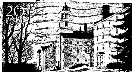
Old Stone Row, Middlebury College, Vermont

FDA COMMISSIONER DOCKETS MANAGER'S BRANCH (HFA 305) FDA-5630 FISHERS LANE RM. 1061 ROCKVILLE, MD 20852