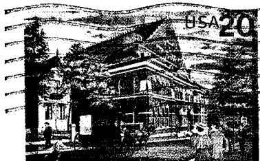
Ryman Auditorium, Nashville, Tennessee

FDA Commissioners Dockets Management Branch (HFA 305) FDA 5630 Fisher's Lane, Room 1061 Rockville, MD 20852