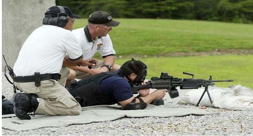
Figure 1: Security personnel participating in weapons training.

addition, NRC resident inspectors assigned to power plants routinely observe licensee security personnel, and will assume additional duties as the agency implements new plans for expanding the role of resident inspectors in security oversight.