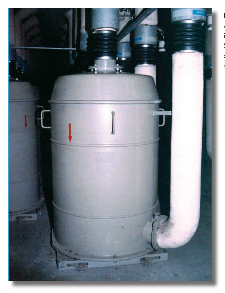
Figure 3-4 A canister-type filter unit is often used for Class 1 Safe Rooms to maximize storage life of the filters.