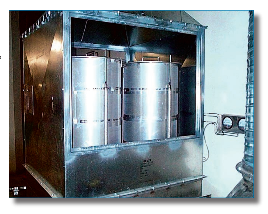
Figure 3-8 A 4,000-cfm filter unit using radial flow filters was selected for the stairwell safe room.

Isolation Dampers . Two sets of automatic dampers are installed in the system, one upstream and one downstream of the filter unit to isolate the filters when not in use.