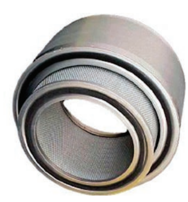
Figure 3-7 A military radial-flow CBR filter set was selected for safe room filtration.