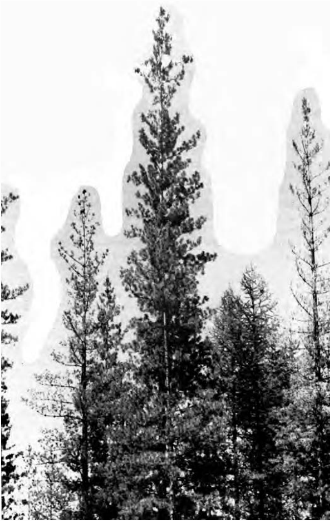
Figure 1. —Part of a diseased western white pine stand. The healthy tree in the center is flanked by two trees in the intermediate stage of pole blight.

Closer examination of trees exhibiting crown symptoms will usually reveal the presence of one or more long, narrow, necrotic lesions paralleling the grain on the trunk of the tree (fig. 2). These may occur throughout the length of the bole but are generally found in the lower half. Dry faces that may be either blue-stained or resin-soaked