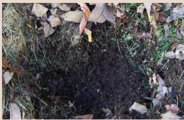
Steven J. Saffier

Move materials from the center to the outside and vice versa. Turn every day or two and you should get compost in less than 4 weeks. Turning every other week will give compost in 1 to 3 months. Finished compost will smell sweet and be cool and crumbly to the touch.