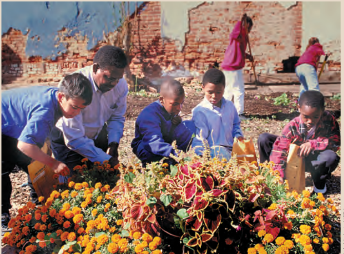
Previous Page (top) Restored community wetland; (center) Rufous Hummingbird, male; (bottom) Urban community garden.