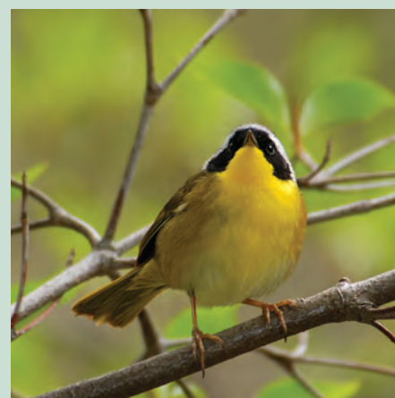
THIS PAGE (top) Wet area below a spring grows wetland plants; (right) Common Yellowthroat, male; (bottom) Restored prairie pothole wetland.

Important! Because of the variety of potential conditions that you can create, and the potential side-effects of blocking drainage ways, you should always consult an expert before starting a wetland project.