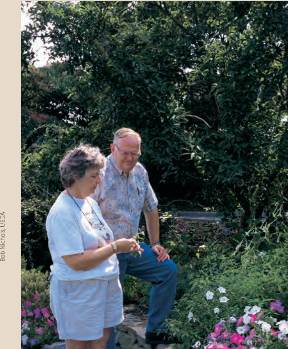
A COLL STORY

(top left) Planting to enhance community areas; (top center) Eastern Bluebird, female, feeding young; (top right) Mulch of grass clippings on vegetable garden; (bottom right) Arboretums and parks foster interest in gardening, horticulture, and environmental issues; (bottom left) Fun and learning in a school garden.