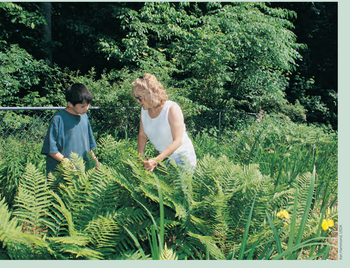
Previous Page Wetland plants in low area between buildings.