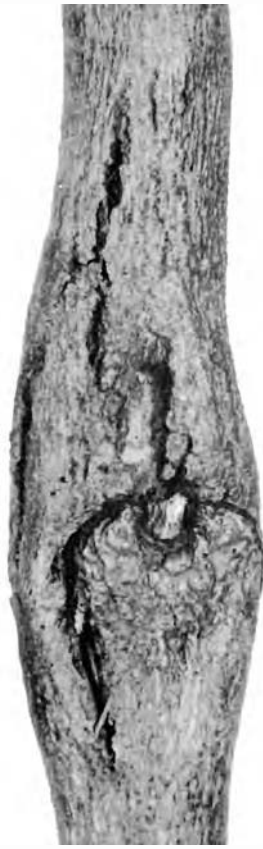
Figure 3. —Target or callus-roll type of canker on sugar maple, typical of older Nectria cankers on many host species.