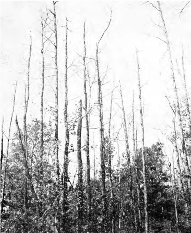
Figure 1.—A badly diseased sweetgum stand.