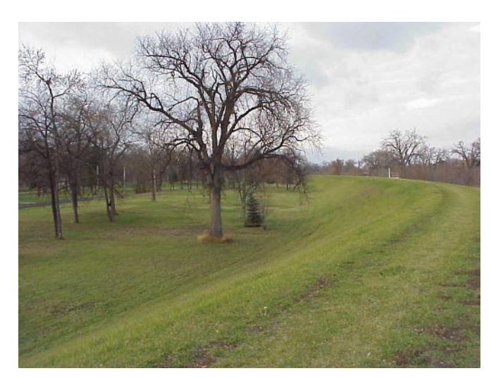
If the Red River (right) tops this dike again, all that will flood is open space instead of neighborhoods.