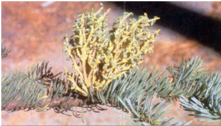
Fig. 3. Female shoots of fir dwarf mistletoe.

Fir live crown ratio has an important effect on the consequences of fir dwarf mistletoe. The effect of dwarf mistletoe on radial, height, and volume growth rates is greatest in trees with good live crown ratios (> 80%), the fastest growing, and become almost negligible in trees with live crown ratios < 40%, the slowest growing. On the other hand, trees with good live crown