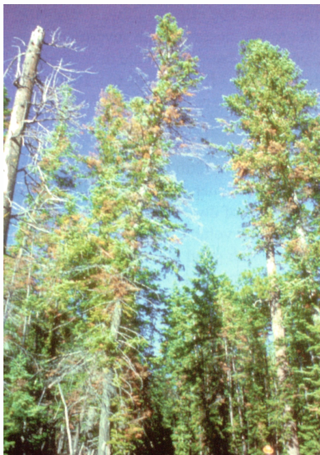
Fig. 4. Branch mortality and flags associated with fir dwarf mistletoe and cytospora canker in severely infected grand fir.

In mixed-species stands that contain fir infected by dwarf mistletoe, silvicultural treatments should favor other tree species. Non-hosts left between infected and non-