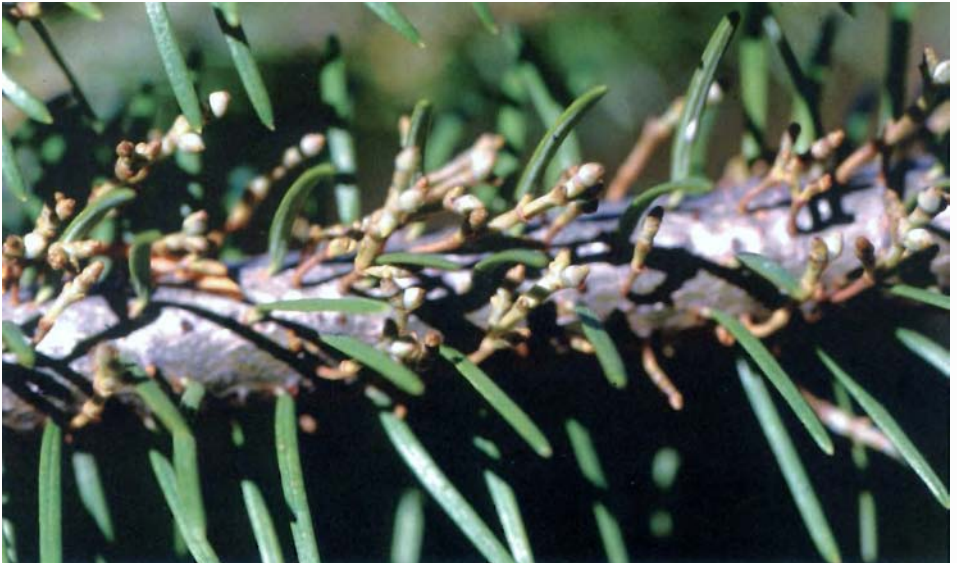
Fig. 2. Aerial shoots of Douglas-fir dwarf mistletoe.

The first symptom of Douglas-fir dwarf mistletoe infection is a slight swelling at the infection site 1 to 2 years after infection occurs. Initially these can be difficult to see. As time passes and the endophytic