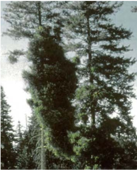
Fig. 3. Large witches' broom in a Douglas-fir.

Douglas-fir dwarf mistletoe typically becomes systemic within the host when the endophytic system invades tree buds at the infection site. Masses of invaded buds are stimulated to grow and develop long twigs, which eventually form witches' brooms. The mistletoe endophytic system grows apically at the same rate as the infected twigs. Aerial shoots can be found on branch growth segments ranging from 2 to 7 years old.