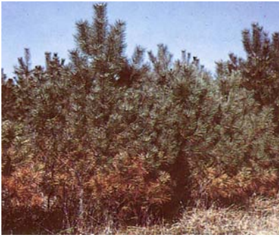
Figure 5.— Dothistroma pini damage severe in lower crown.