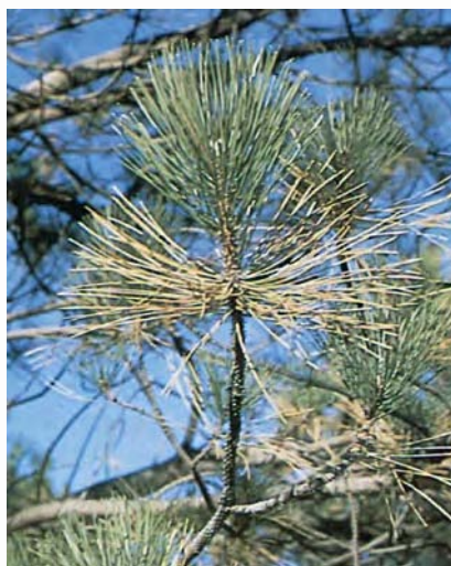
Figure 8. — Resistant first-year needles and susceptible second-year needles of Austrian pine.

The use of genetic resistance looks promising for preventing or reducing damage by this fungus. Resistant strains or clones have been identified in Austrian, ponderosa, and Monterey pines. Seed from a Yugoslavian source, which has shown high resistance, is currently used to produce Austrian pines for Great Plains plantings. Recently, several geographic sources of ponderosa pine have been identified as having high resistance. Needles of all ages are highly resistant on some trees. On other trees, current-year needles are resistant, but older needles are susceptible (fig. 8).