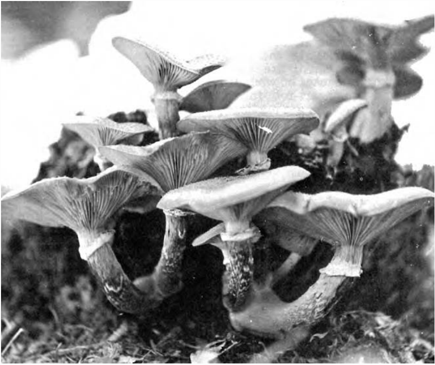
Figure 2. — Fruiting bodies of Armillaria mellea showing the gills that bear the spores on the under surface. F-522049

white rot in oak. In the advanced stage, the wood may be decomposed completely, leaving large hollows lined with yellowish mycelium. The soft annual conk, white at first, turns yellowish or brownish with age. It is globular with a hairy top and long slender teeth or spines on the lower surface (fig. 4).