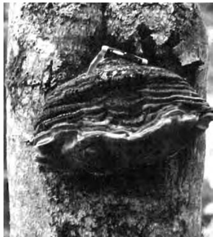
Figure 3. — Conk of the false tinder fungus ( Fomes ignarius ) on a living beech. F-522050

Pleurotus ostreatus Jacq., the oyster mushroom, causes a white, flaky rot of various hardwoods.