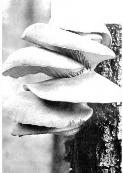
Figure 5. — Irpex mollis conks on red oak.