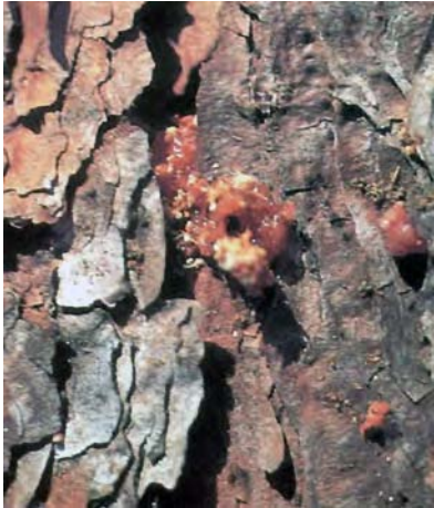
Figure 2. —Reddish-brown boring dust at the location of a recent Ips attack.