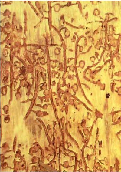
Figure 8. —Typical Y- or H-shaped gallery pattern of Ips calligraphus and I. grandicollis .