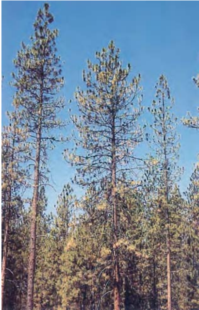
Figure 2 —Scale-infested ponderosa pines near Burney in northeastern California.

bodies, often tightly packed against each other, can be seen along the needles. (See cover photo. Scales are magnified approximately eight times.)