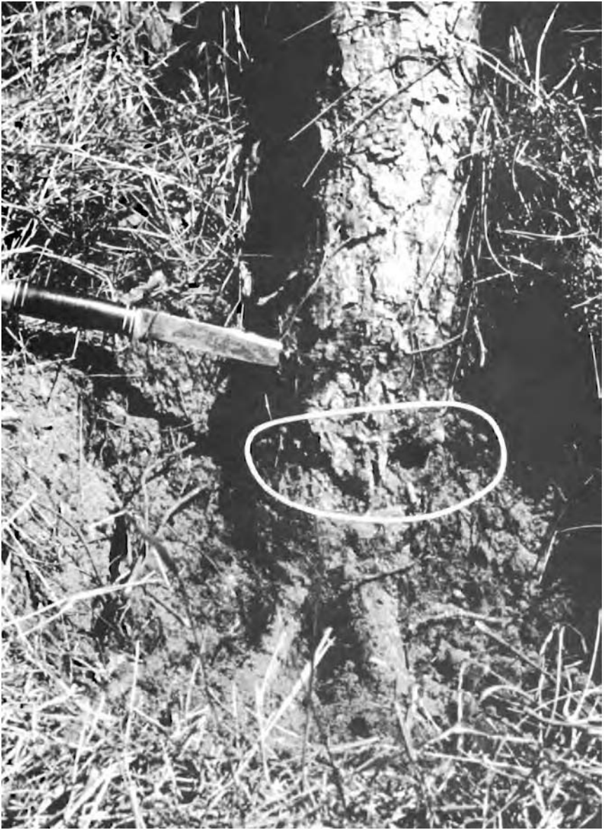
Figure 1.—Root collar of young red pine severely injured by larvae of the pine root collar weevil (below knife).