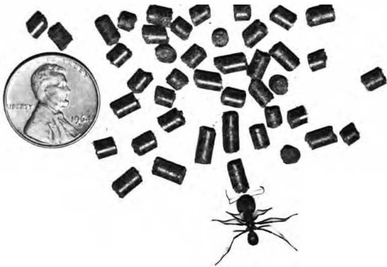
Figure 4.—Pellets attract foraging workers.