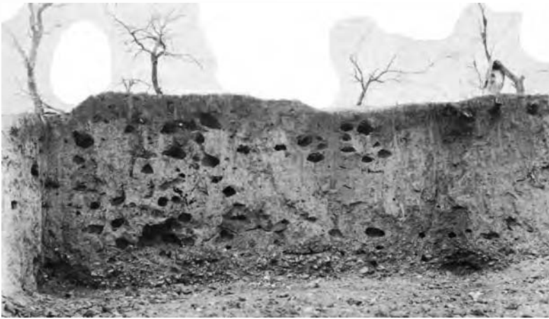
Figure 3.—A cut through the center of a nest of the Texas leaf-cutting ant. The nest at this point is 8 feet deep.