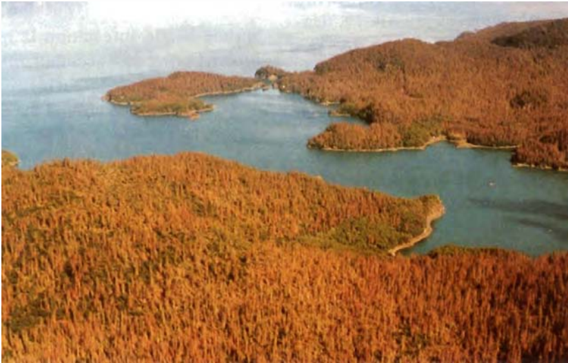
Figure 1 — Yellowish orange and reddish colors of faded spruce are evidence of an intense spruce beetle infestation in Alaska.

E.H. Holsten 1 , R.W. Thier 2 , A.S. Munson 3 , and K.E. Gibson 4