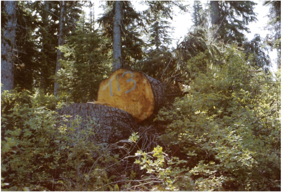
Figure 8 — Green trees (“trap trees”) felled to capture emerging spruce beetles.

suppression methods are short-term responses to existing beetle populations and, therefore, address only an immediate need.