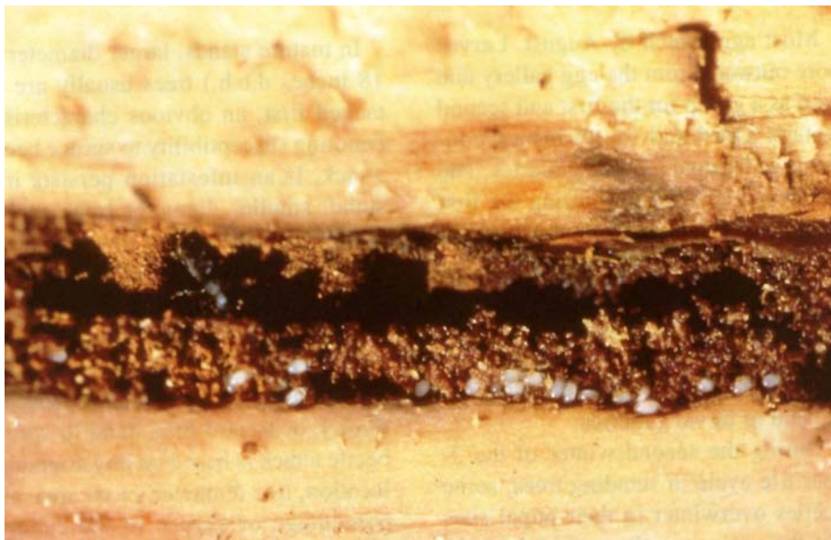
Figure 5 — Spruce beetle eggs along side of egg gallery.