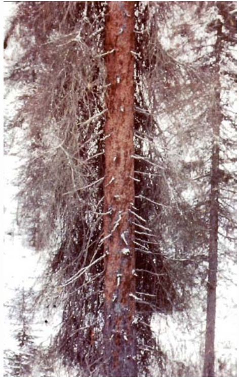
Figure 3 — Infested spruce debarked by woodpeckers.

Adult beetles are dark brown to black with reddish-brown or black wing covers. The beetles are cylindrical, approximately 1/4 inch long, and 1/8 inch wide (fig. 4).