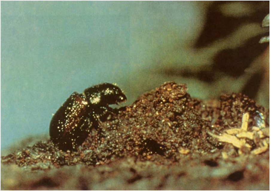
Figure 4 — An adult spruce beetle.