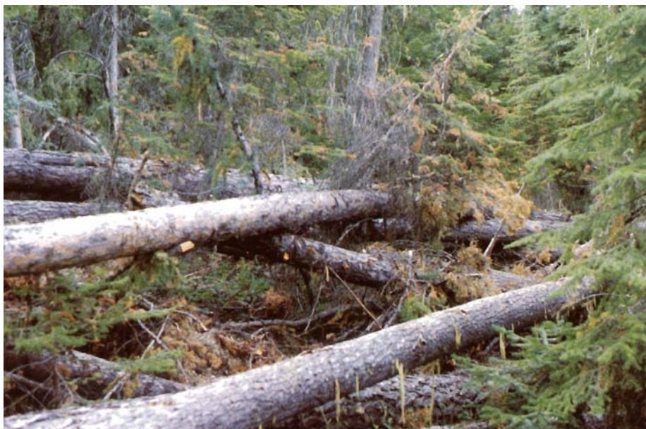
Figure 7 — Windthrown trees and large diameter logging residuals — prime habitats for beetle populations.