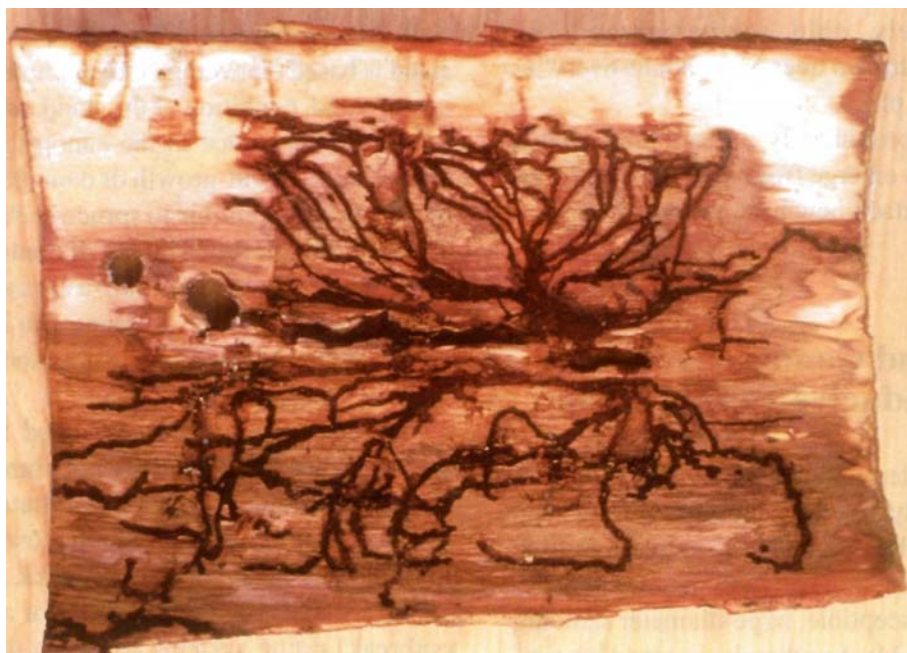
Figure 6 — Spruce beetle larval galleries.