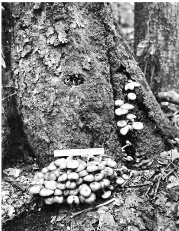
F-514871 Figure 4. — Fruiting bodies of armillaria root rot associated with hemlock deca- dence (about one- seventh actual size).

Insecticidal control of the hemlock borer is not practical.