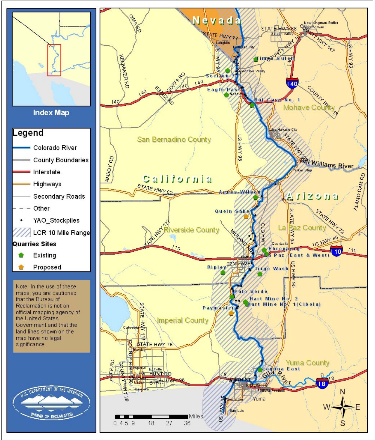
Figure 1-General Location of Project Area and Quarry Sites