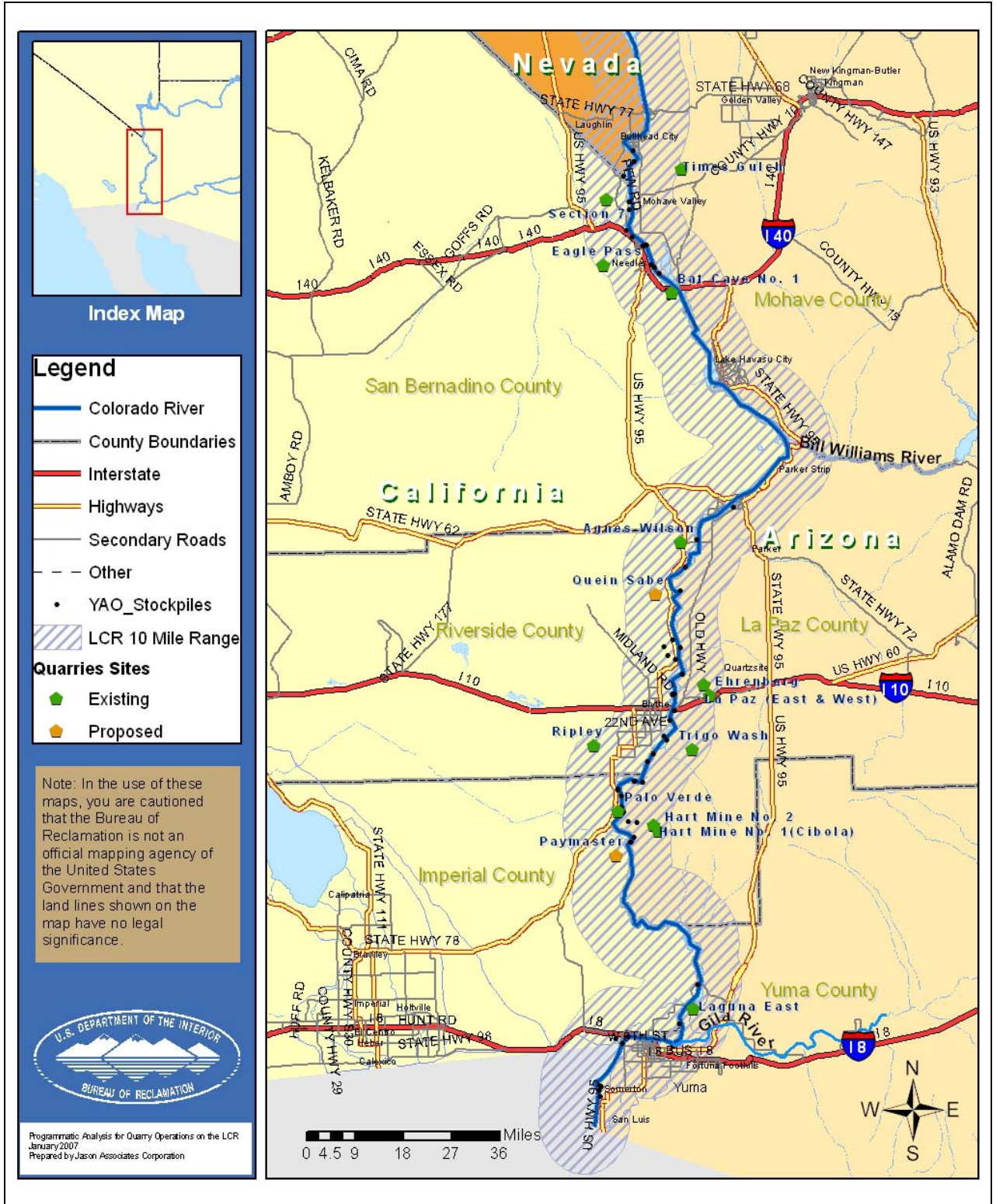
Figure 2-Existing and Proposed Quarry Locations Along the Lower Colorado River